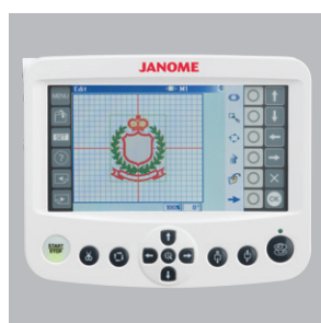
RCS (Remote Computer Screen)

LCD color touch screen. Large viewing area. USB slot on side. Attaches to MB-4S or is free standing.